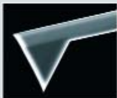
Arrow™ -Series Silicon-SPM-Probes