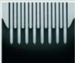
Arrow™ Tipless Cantilevers and Cantilever Arrays

NanoWorld AG Rue Jaquet-Droz 1 2007 Neuchâtel, Switzerland Phone: +41 (0) 32 720-5375 Fax: +41 (0) 32 720-5775