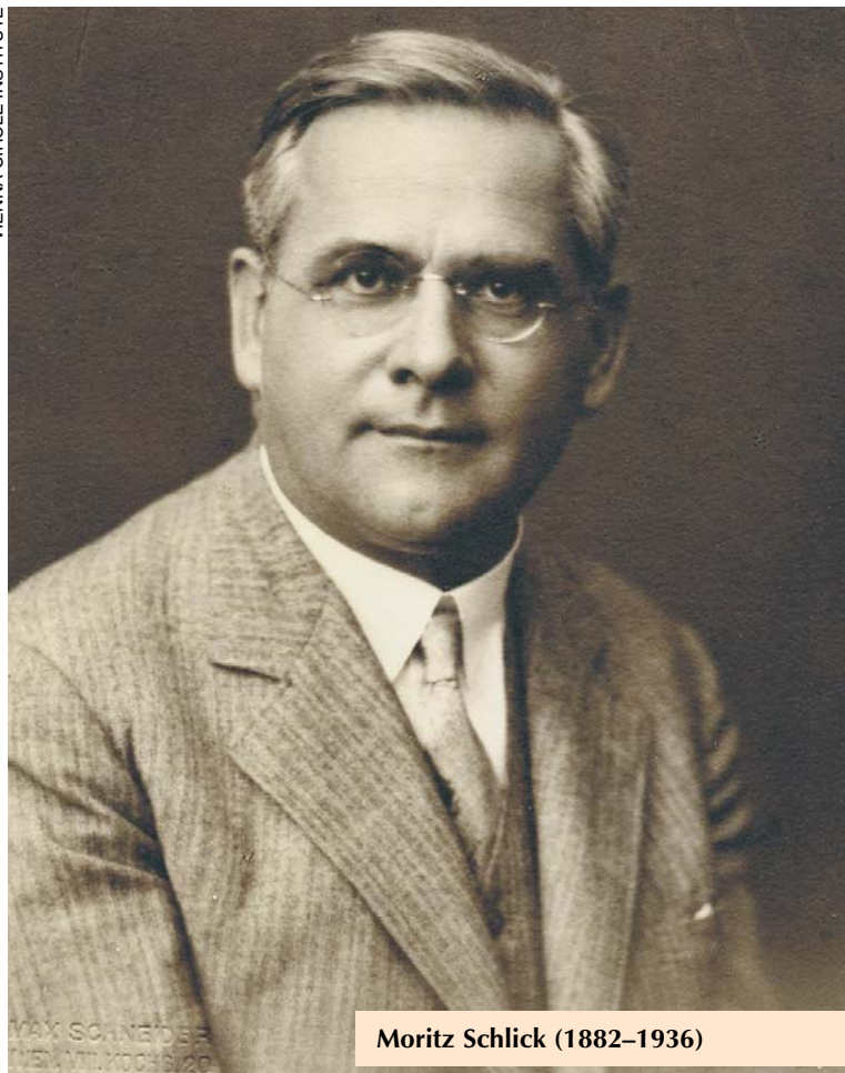
Moritz Schlick (1882–1936)

there be any difference? The paper goes on to fault the idea of objective determination of simultaneity between distant events for similarly philosophical reasons; nothing other than the simultaneity of immediately adjacent events is directly observable. One must therefore stipulate which distant events are deemed simultaneous for a given observer. But that stipulation must rest on a conventional assumption about, say, the equal speeds of outbound and inbound light signals.