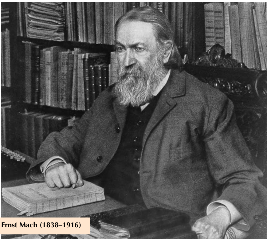
Ernst Mach (1838–1916)

books were, at the end of the century, well known to intellectually ambitious young physics students.