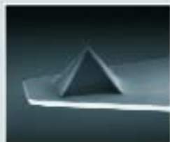
Hybrid-Nitride™ -Series SiN-SPM-Probes