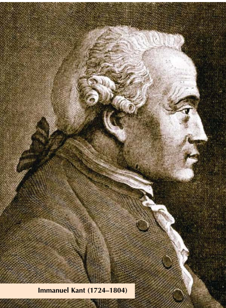
Immanuel Kant (1724–1804)

important member of the so-called Vienna Circle of logical empiricists. Frank's 1947 Einstein biography is well known. 10