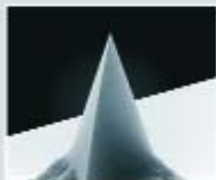
Pointprobe™ -Series Silicon-SPM-Probes

Using our knowledge as well as our high precision Scanning Probes, our clients are able to get the best results they need for atomic force microscopy (AFM).